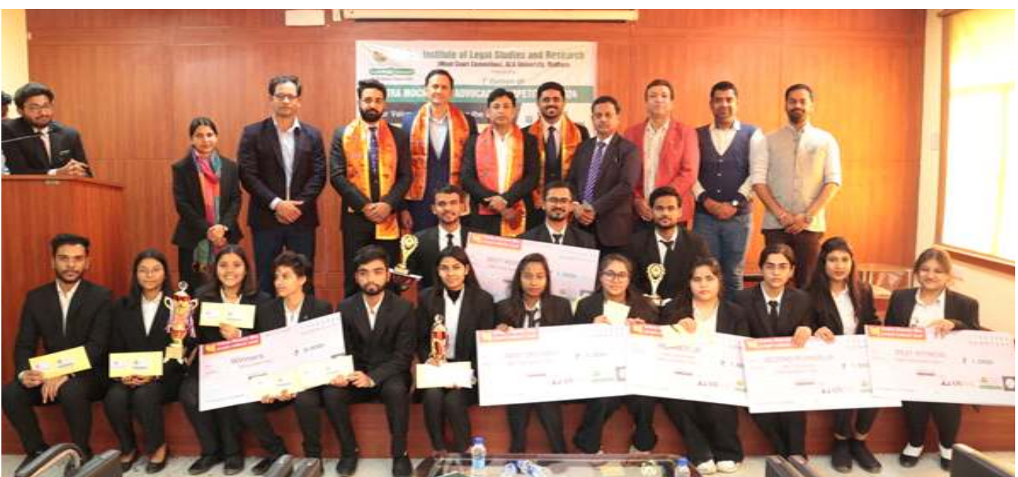
Winning teams along with the esteemed judges.