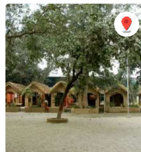
Raman-Reti Temple, Gokul, Mathura