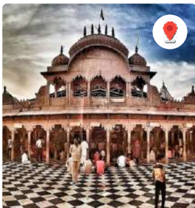
Radha Rani Temple, Barsana