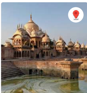
Kusum Sarovar, Goverdhan