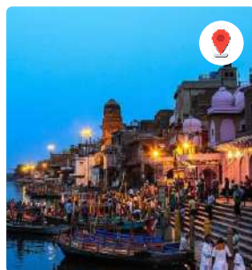
Vishram Ghat, Mathura