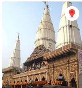
Danghati Mandir, Govardhan