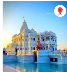
Prem Mandir, Vrindavan