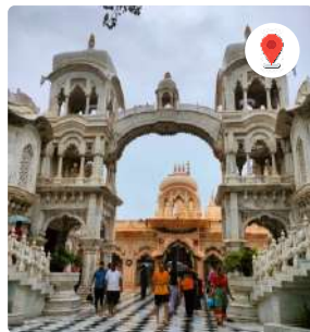
ISKON Temple, Vrindavan