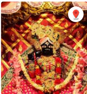
Bankey Bihari Temple, Vrindavan

Mathura, a sacred city in Uttar Pradesh, India, is a revered pilgrimage site for Hindus, Buddhists, and Jains. Located on the banks of the Yamuna River, Mathura is considered one of the seven sacred cities in Hinduism and is famous for being the birthplace of Lord Krishna. The city boasts numerous temples, including the Shri Krishna Janmabhoomi Temple and the Dwarkadhish Temple, as well as the Mathura Museum, which showcases ancient artifacts and sculptures. Visitors can also explore the nearby town of Vrindavan, famous for its beautiful temples and gardens, and Goverdhan Hill, a sacred site where Lord Krishna is said to have lifted a mountain. Additionally, the iconic Taj Mahal in Agra, a UNESCO World Heritage Site and one of the Seven Wonders of the World, is just 70 km away from Mathura, making it an ideal day-trip destination. With its rich history, cultural significance, and spiritual attractions, Mathura is a must-visit destination for anyone interested in exploring India's divine heritage.