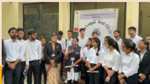
5 Clubs & Committee