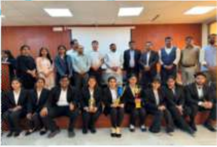
Debate competition organized by Jurist Club, ILSR.